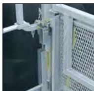
Safety: sensors prevent from platform movements when front part is opened