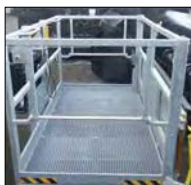
Sliding bar access on each side