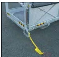
2 roof presence sensors